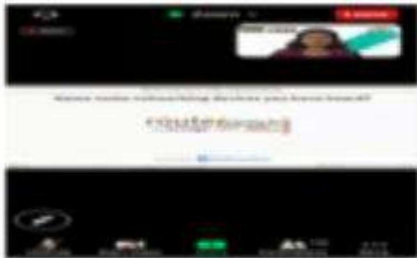
HoL Lab on VMware Networking

Virtual VMware HoL session was scheduled on 6 th , 9 th and 11 th October 2021. Trainers from VMware took the session virtually and around 46 pre-final year students from CSE & ISE Department participated and completed as per scheduled date.